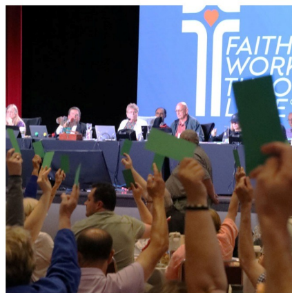
Delegates vote using green cards to signify approval.

The 2025 Annual Conference of the Church of the Brethren renewed the agency status of Bethany Theological Seminary, Eder Financial, and On Earth Peace, and approved numerous recommendations from study committees.